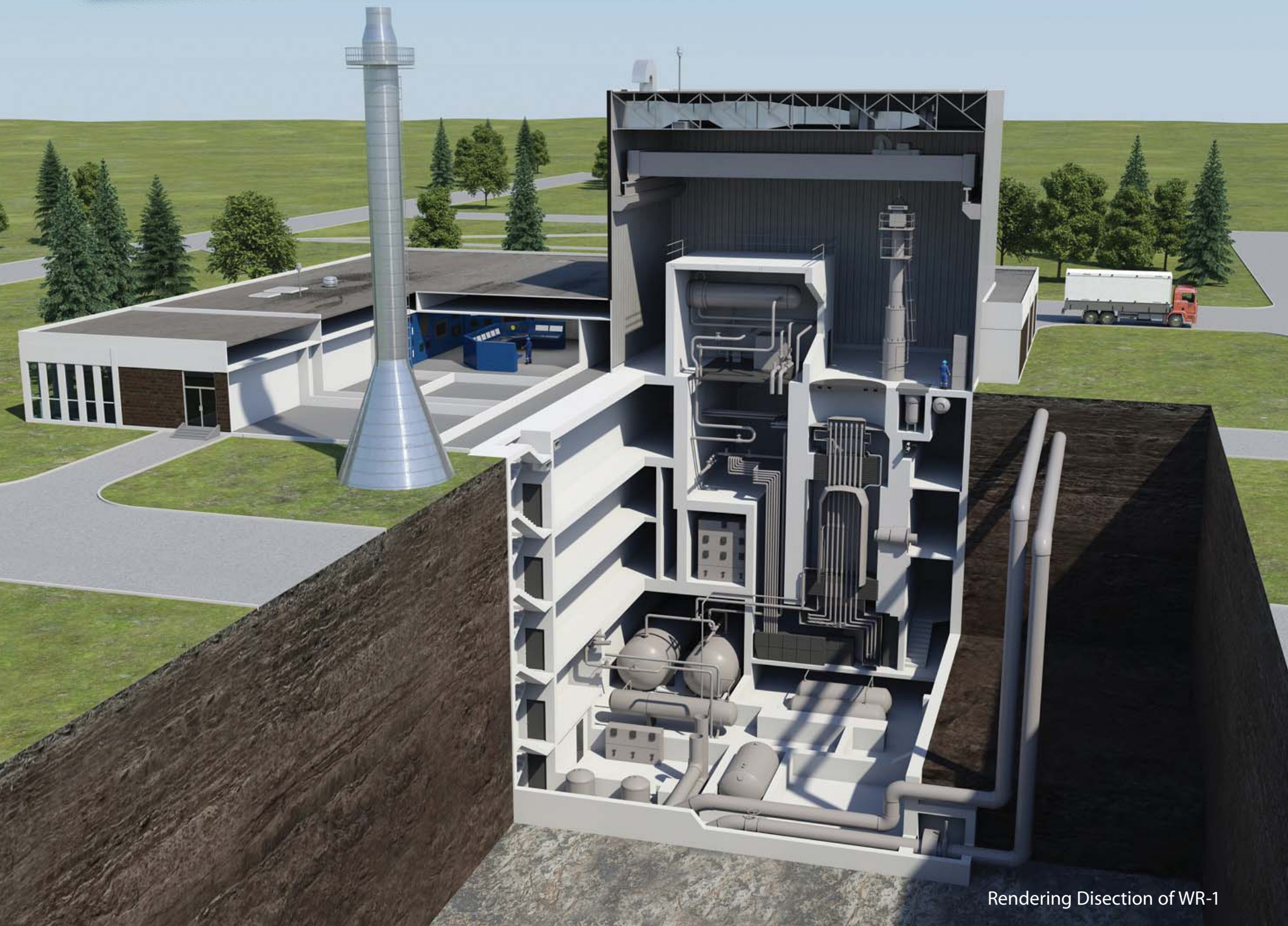
Rendering Dissection of WR-1

The Government of Canada is taking action to decommission nuclear sites across the country. To tackle WR-1, Canadian Nuclear Laboratories (CNL) is proposing in situ decommissioning as the preferred option for WR-1 decommissioning. This option results in a permanent, passive disposal on site by encasing all below surface structures and systems in place with concrete grouts. The structure will then be capped with concrete and covered with an engineered barrier.